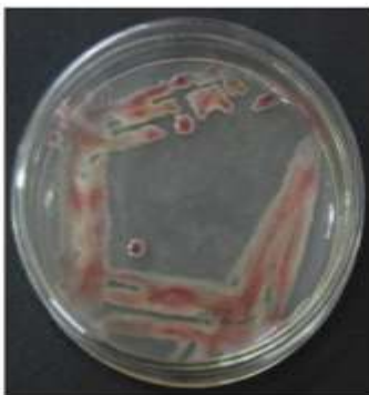
Plate2. Pure culture of Ralstonia solanacearum .